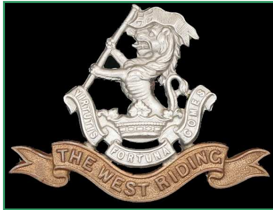
WW1 West Riding Regiment Cap Badge