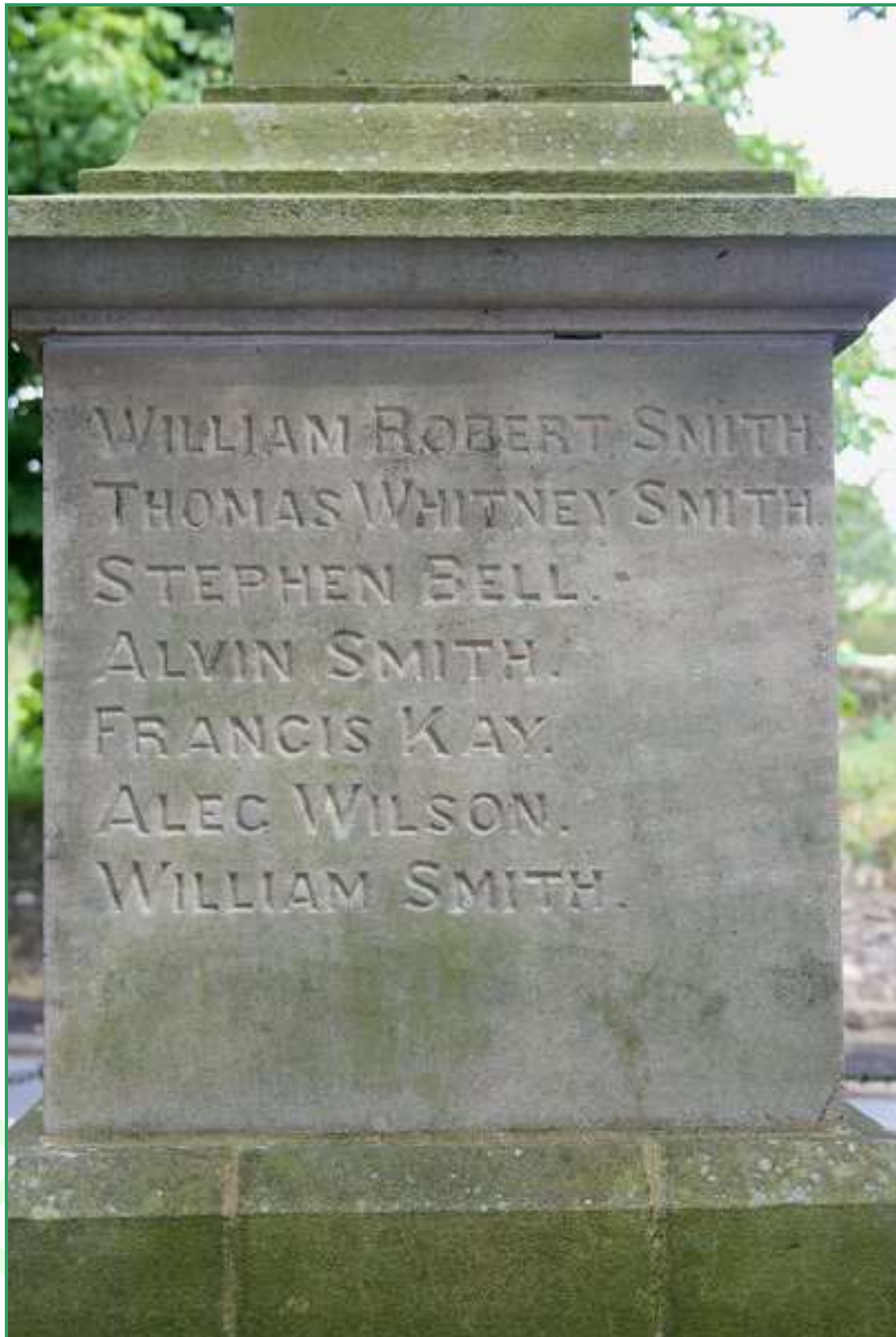
Lothersdale war memorial