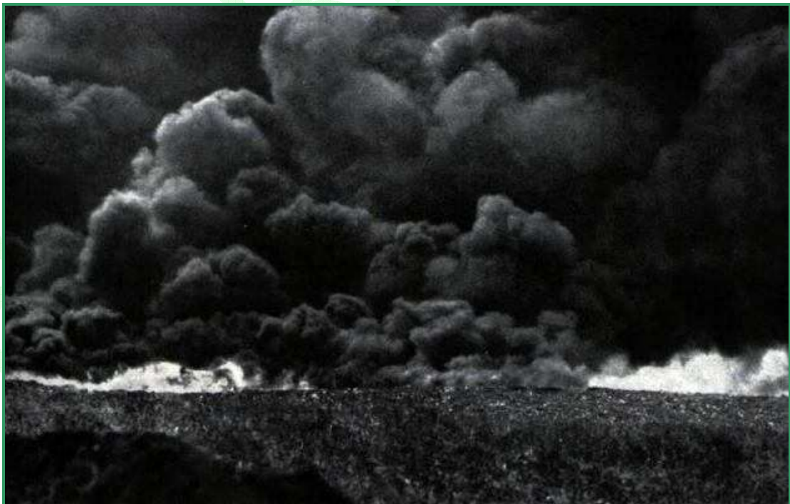
A view of the battlefield during attack, WW1