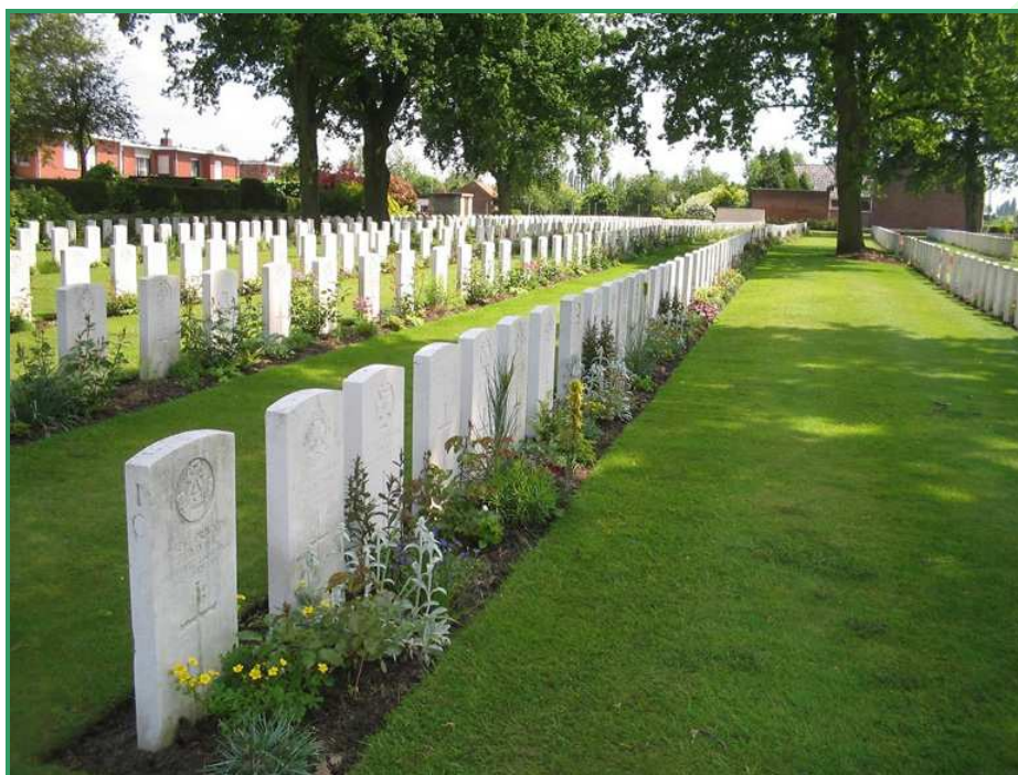
Poperinghe New Military Cemetery, Belgium

The Poperinghe New Military Cemetery contains 677 Commonwealth burials of the First World War including that of Pte Francis John Kay and 271 French war graves. The cemetery was designed by Sir Reginald