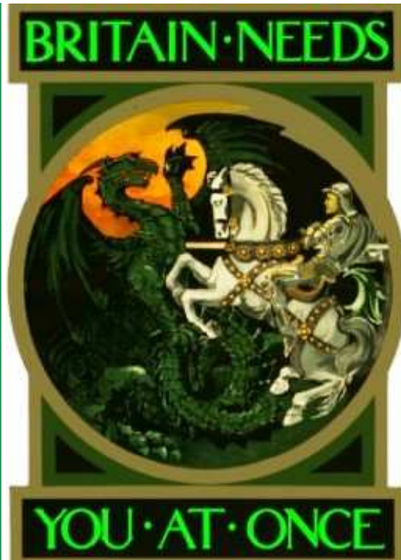
Parliamentary Recruiting Committee London, 1916