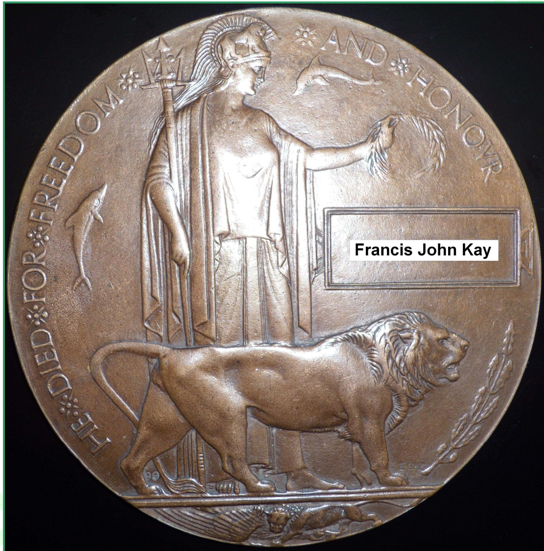
Original WW1 Memorial Plaque (name digitally altered) Also referred to as a Death Plaque or Dead Man's Penny

A Memorial Plaque inscribed with the soldiers name was also given to the family of those who were killed during WW1