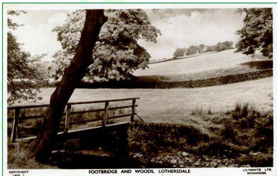
Footbridge and woods, Lothersdale