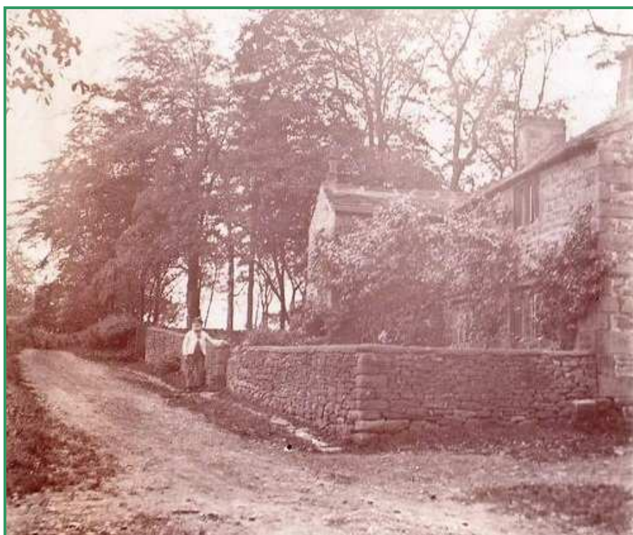
Lane Ends c1895, Sutton-in-Craven