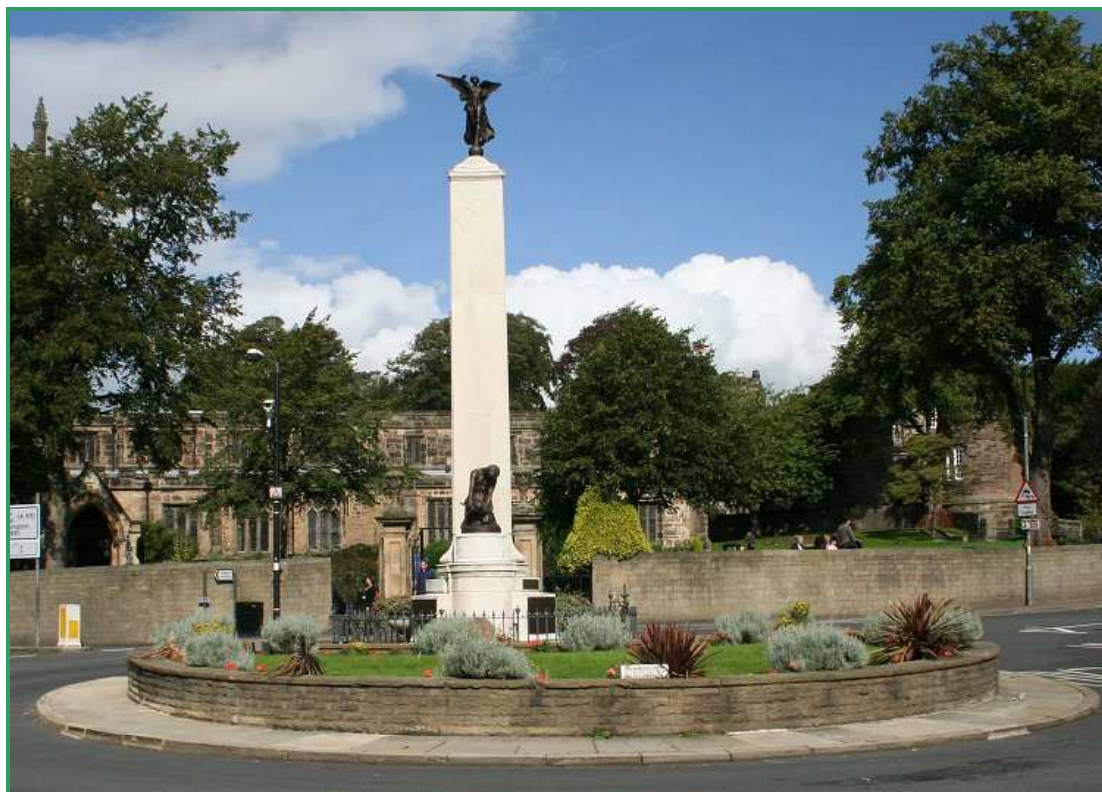
Skipton war memorial