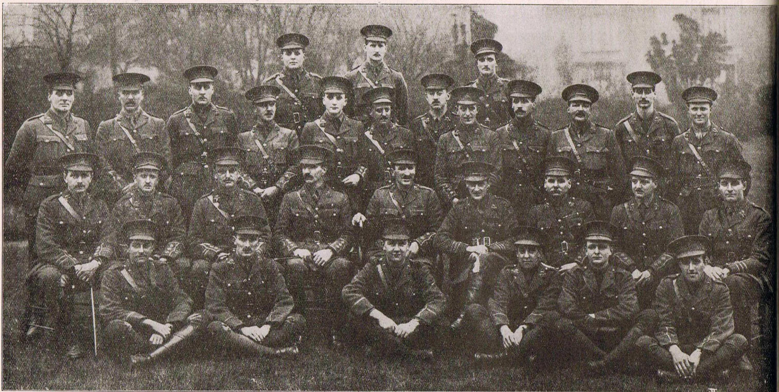
1/6th DUKE OF WELLINGTON'S WEST RIDING REGIMENT.