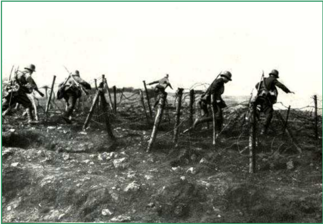
German storm troopers running through the barbed wire entanglement, WW1