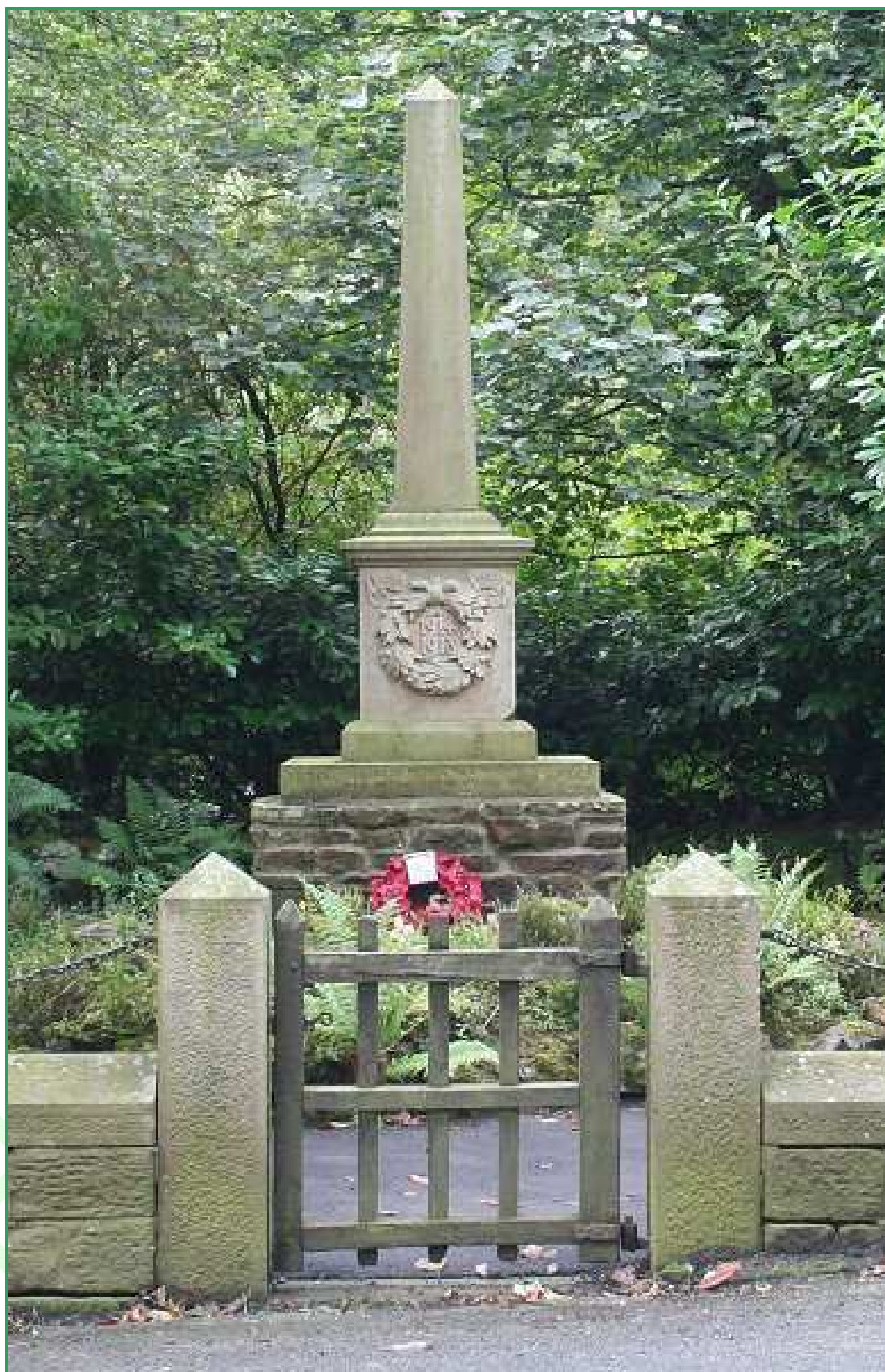
Lothersdale war memorial