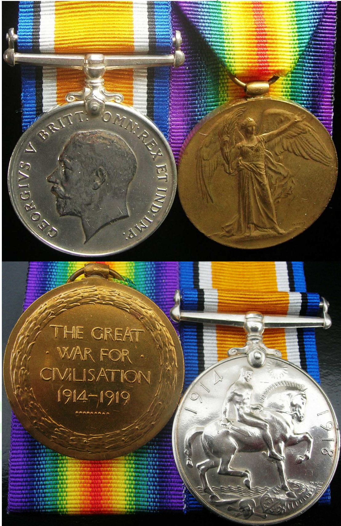
Original pair of WW1 medals