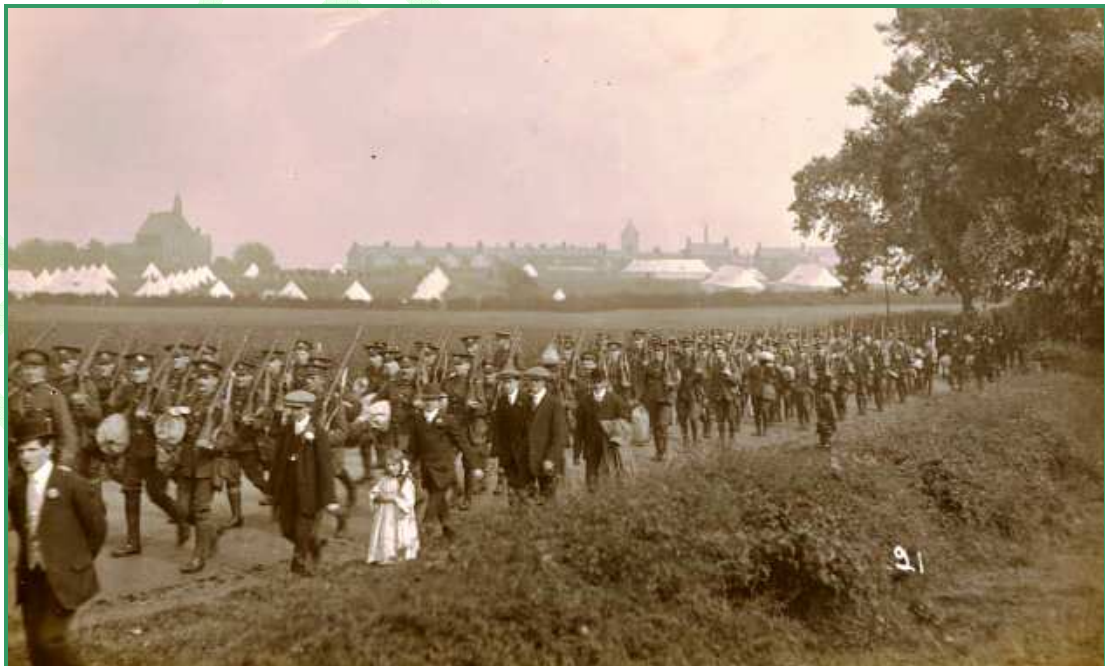
British volunteers, 1914 (Kitchener's new army)