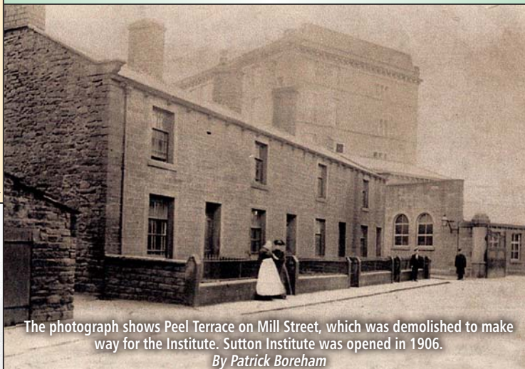
The photograph shows Peel Terrace on Mill Street, which was demolished to make way for the Institute. Sutton Institute was opened in 1906.