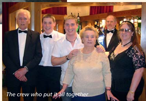
The crew who put it all together