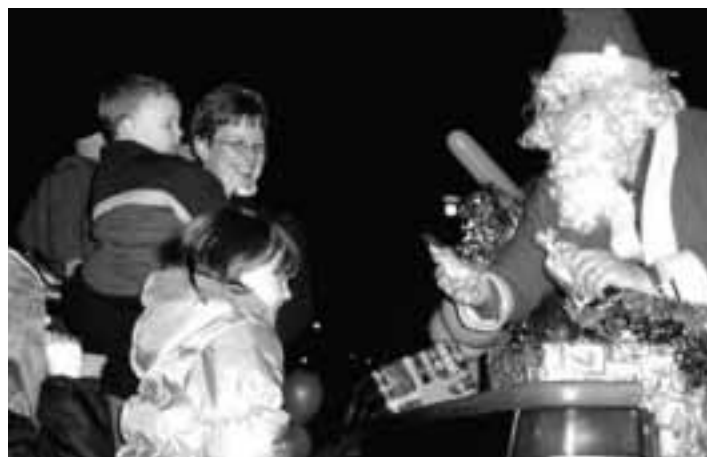
Children receiving presents from Santa at one of his many stops during the Conservation Group's "Santa's Sutton Tour" on Christmas Eve.