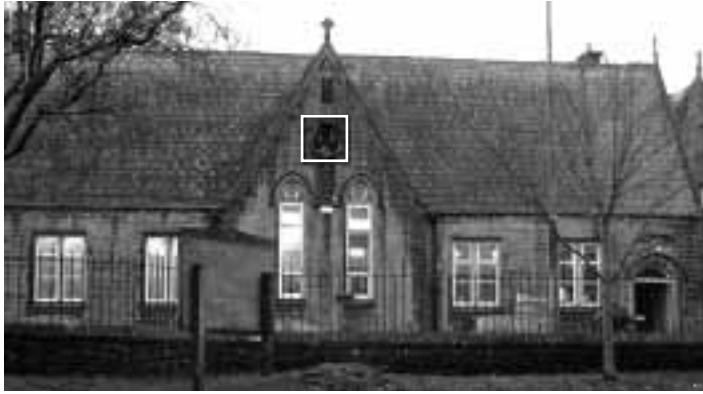
The answer to last edition's "Where the heck's that". The clover shaped window at the church school was pointed out to me by Luke Suri who is a pupil there. MH